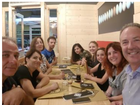
Italian host family out for Pizza!

For the next two weeks, I went to Italy. I first started my stay in Italy by staying with a host family in Lecce for a week. There I spent my days by the Adriatic Sea, visiting the center, and eating lots of pasta and pizza! For the next week, I attended Camp Apulia in Alberobello, Italy. During camp, we visited many cities in the South of Italy and toured caves, cathedrals, museums, and more.