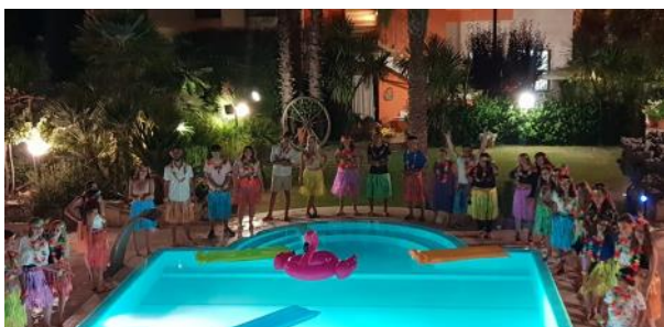
Hawaiian night at camp at our hotel

We met other lions at different gatherings, including a ceremony our last night where we had to give a speech in Italian. I know very little Italian so it was interesting, but something I will always remember. My favorite part of camp was making friends from all over the world. I have made lifelong friends and memories with others from camp that I will cherish forever.